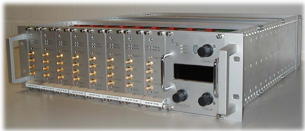
19" XFFTS crate equipped with eight XFFTS boards and one XFFTS controller

Each XFFTS-board operates from a single 5 Volt source and dissipates less than 30 Watt, depending on the actual configuration in terms of bandwidth and number of spectral channels. Precise time stamping of the processed spectra is realized by an on-board GPS/IRIG-B time decoder. Furthermore, the 10-layer boards include a programmable ADC clock synthesizer for a wide range of configurations (bandwidth: 0.1 – 2.5 GHz), making the spectrometer flexible for different observation requirements.